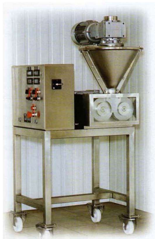
Micro-compactor type : PB1/150/30

These micro-compactors are available in 2 versions :