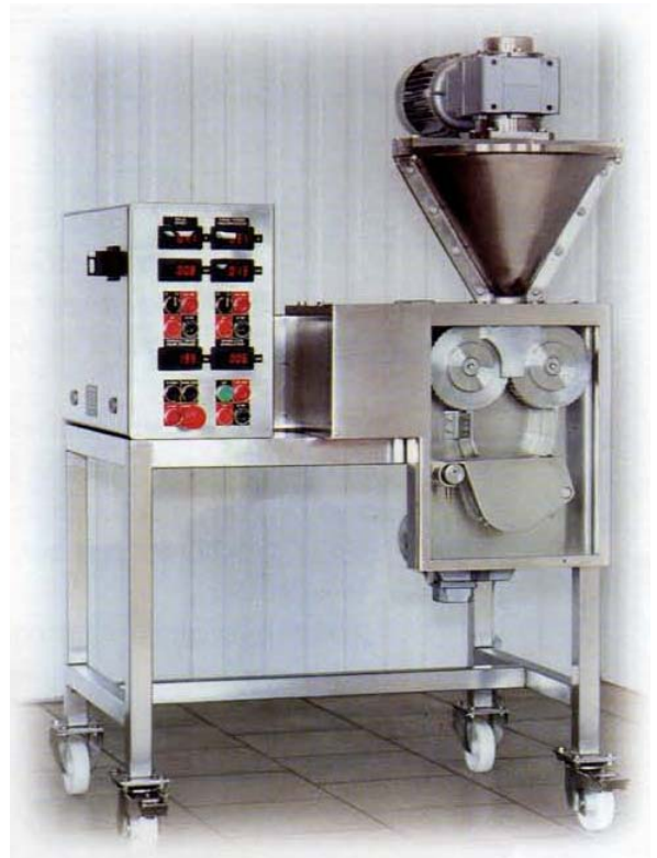
Micro-compactor type : MP1/150/30

The rolls are installed in cantilever or they are mounted outside the mechanical part of the machine. This was specially designed to completely isolate the "process zone" from the mechanical part of the compactor. The surface of the rolls (pocketed, knurled, corrugated,...) depends on the process adopted and the product to treat.