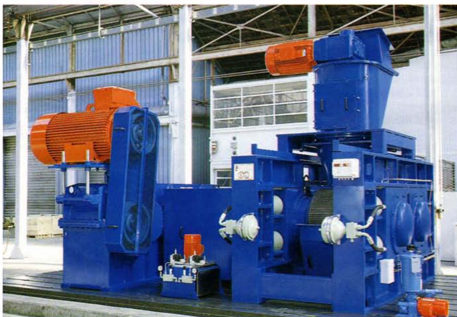
Compactor in Sahut Conreur's manufacturing plant prior to shipment

The compaction-granulation process is really a highly versatile and inexpensive method of producing granular fertilizer which makes it particularly profitable for the fertilizer producers.