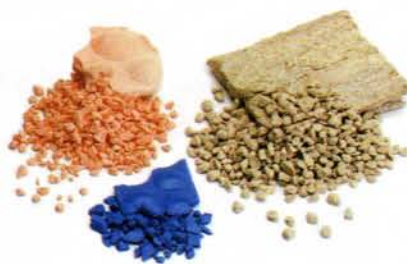
Examples of compacted material before and after granulation

Being a dry process, compaction-granulation has many advantages. No energy is required for drying; energy for the process is supplied in the form of electricity. As there are few corrosion problems, maintenance costs are kept low. The level of pollution caused by the process is very low because there are no liquid or